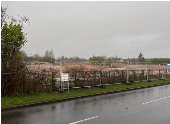
Construction work at the Cannondown Road sites.