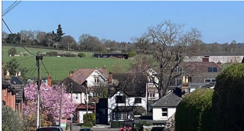
Grange Farm, from High Road, Cookham.

Cookham Parish Council's Planning Committee has influence rather than power. We don't decide the result of planning applications- that is the Royal Borough of Windsor and Maidenhead's (RBWM's) job. However, we do provide key local input, informed by our collective knowledge of Cookham and its community, into the RBWM's and others' planning processes.