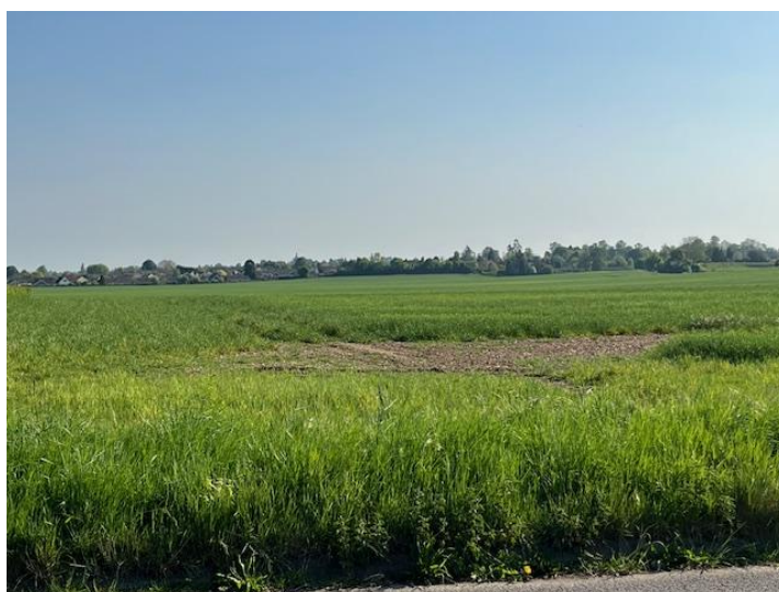
View from Long Lane, Cookham, across the Green Belt to Maidenhead

Cookham Parish Council's Planning Committee has influence rather than power. We don't decide the result of planning applications- that is the Royal Borough of Windsor and Maidenhead's (RBWM's) job. However, we do provide key local input, informed by our extensive collective knowledge of Cookham and its community, into the RBWM's and others' planning processes.