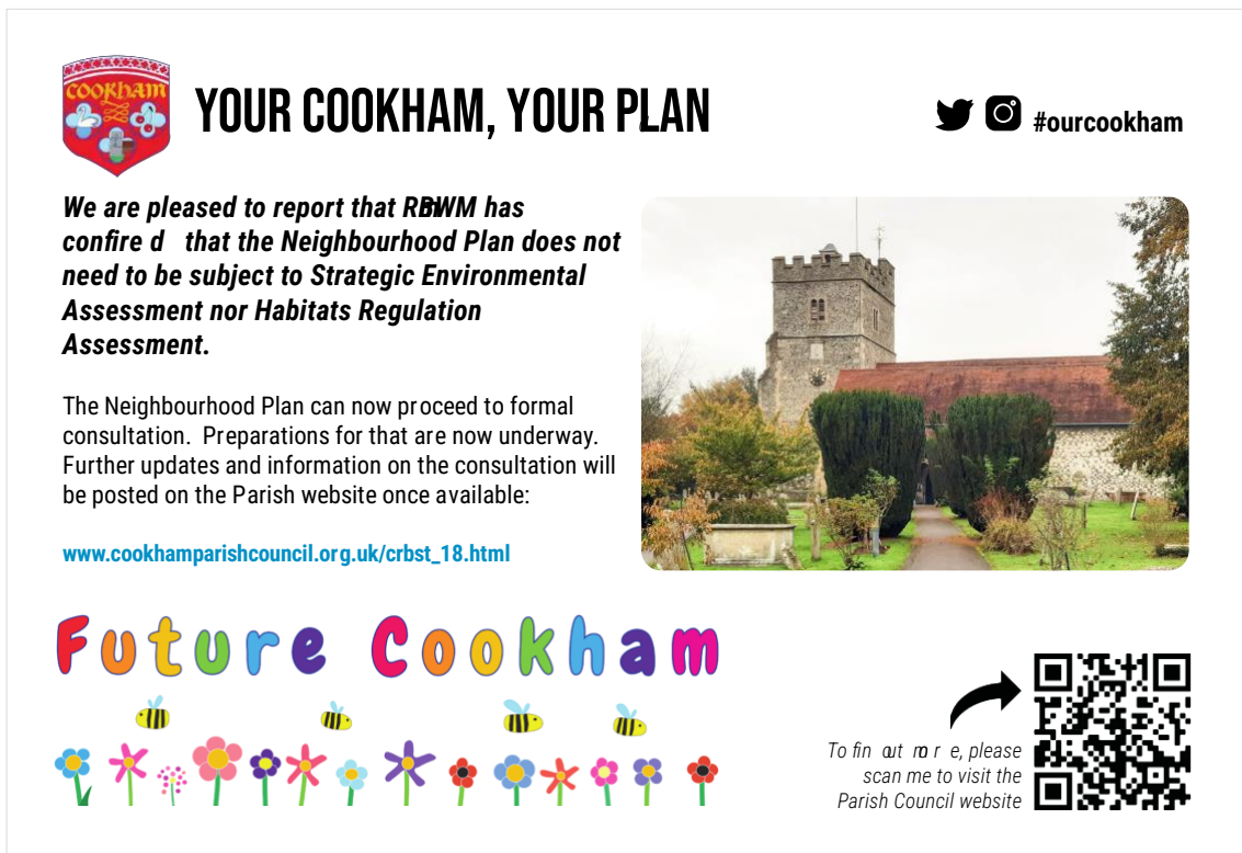
Figure 14: Advert from the Parish Magazine in August 2023 explaining that the draft Plan had been 'screened-out' for both SEA and HRA purposes