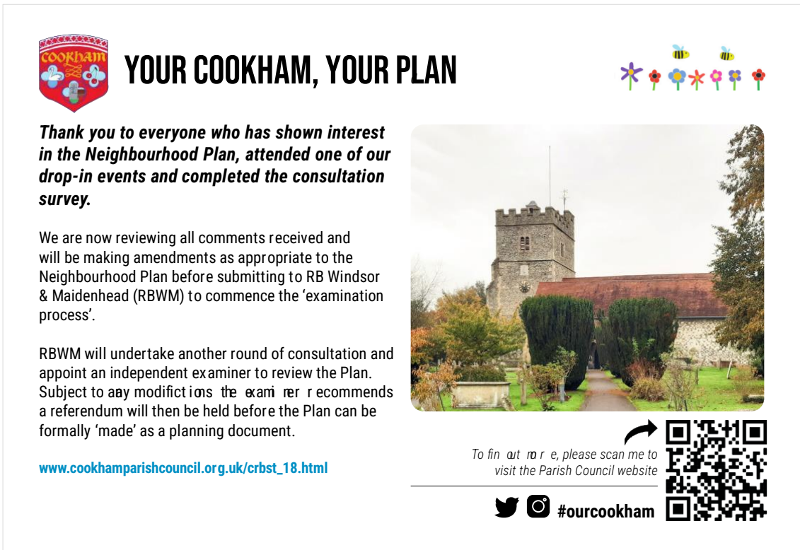
Figure 16: Advert from Parish Magazine in June 2024 outlining the next steps in the process following the Regulation 14 consultation