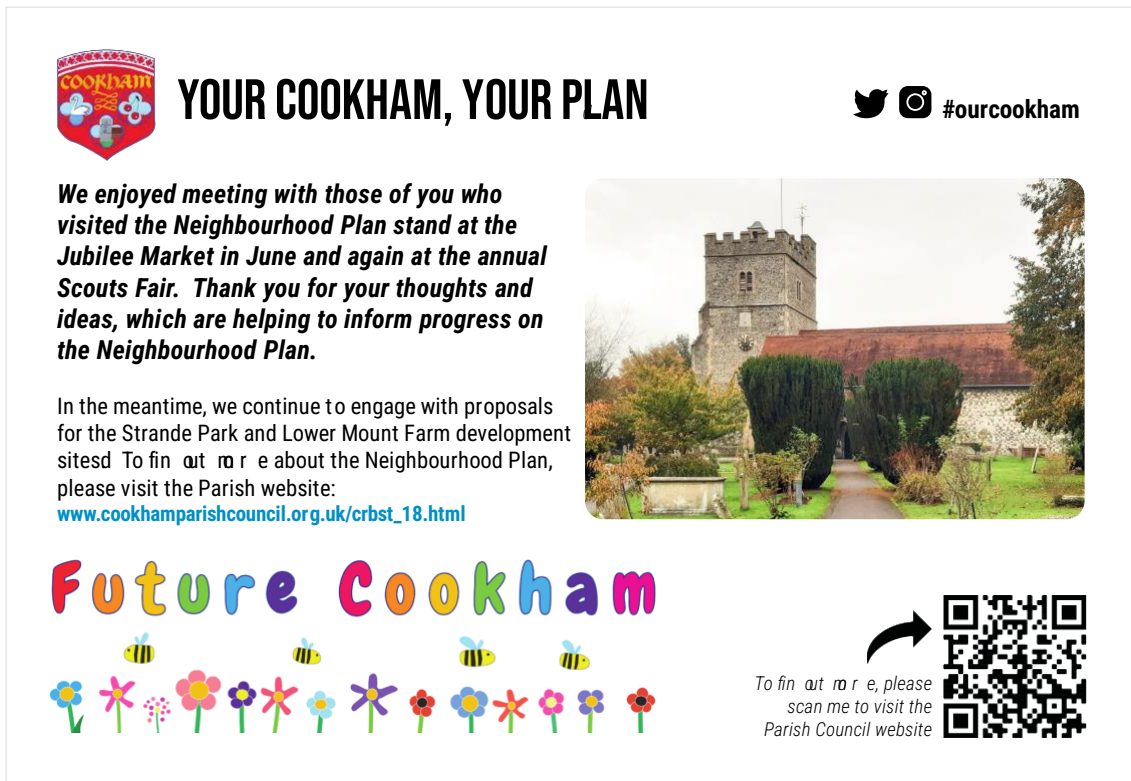
Figure 9: Advert from Parish Magazine in June 2022 reporting on progress and ongoing discussion held about the Neighbourhood Plan at the Jubilee Market and Scouts Fair.