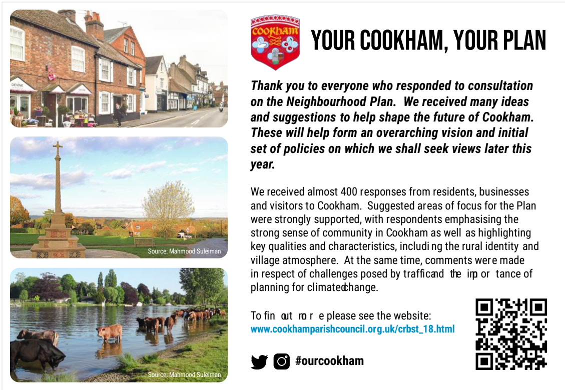
Figure 3: Advert from Parish Magazine in April 2021 following the first round of consultation on the Neighbourhood Plan.