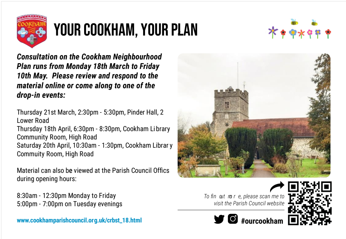
Figure 15: Advert from Parish Magazine in March 2024 containing details of drop-in events for the Regulation 14 consultation of the Neighbourhood Plan