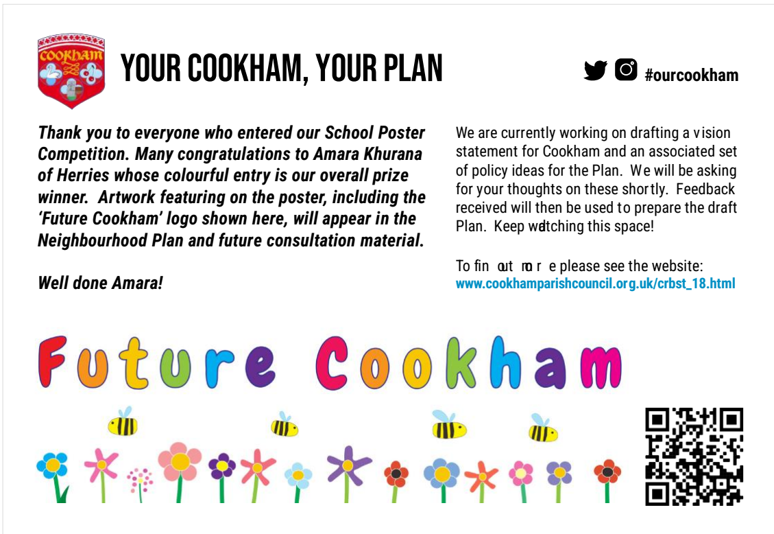
Figure 4: Advert from Parish Magazine in May 2021, announcing the winner of the school poster competition