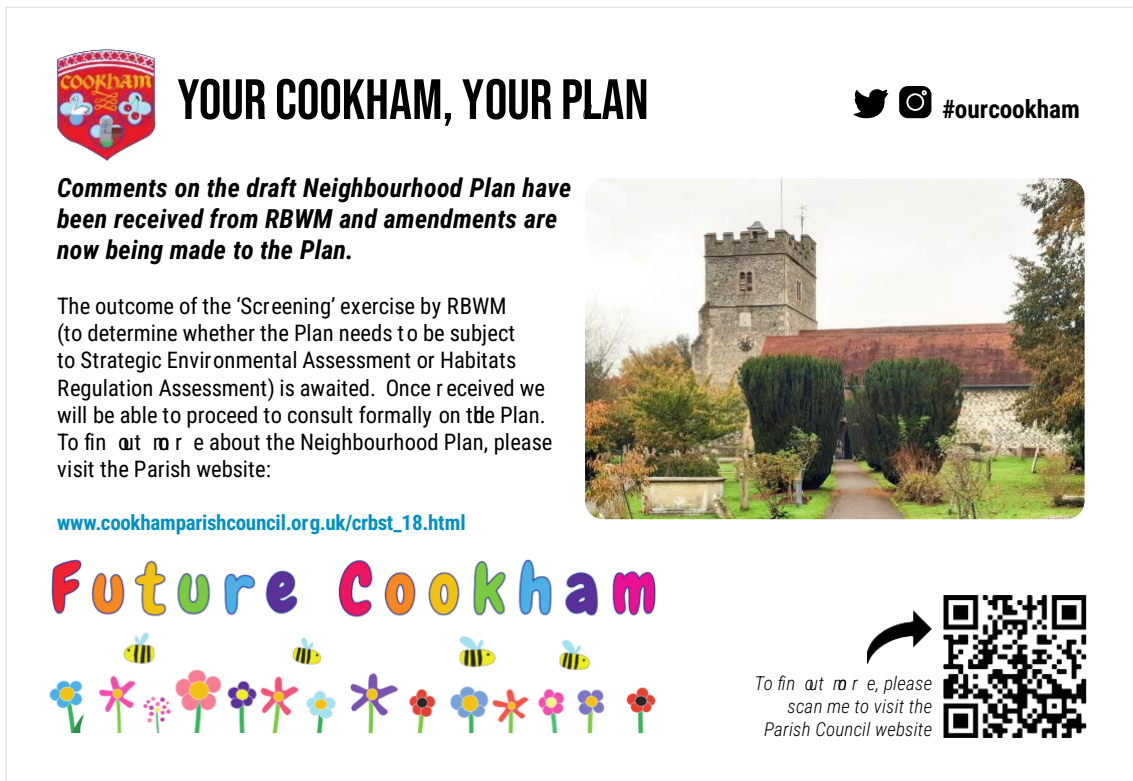
Figure 13: Advert from the Parish Magazine in May 2023 explaining that the draft Plan was subject to screening for SEA / HRA purposes