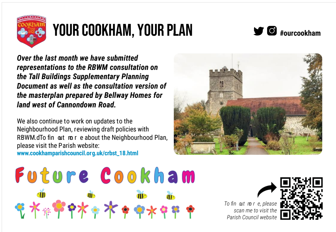
Figure 10: Advert from October 2022 explaining that the Working Party was responding to production of the Tall Building study being consulted upon by RBWM