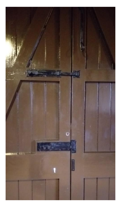
Large door, nearest the road, showing the bolts at the top and across the door.